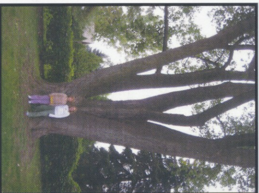
Big Tree Hunt—Farmington Hills