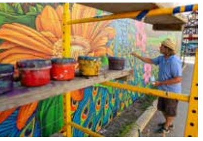
Magnificent Journey Mural