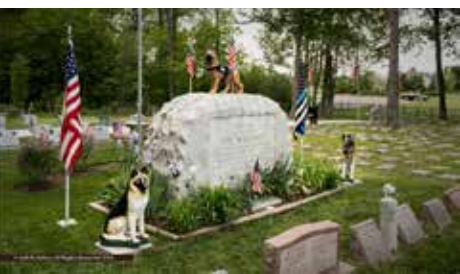
Michigan War Dog Memorial